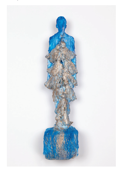
Boreas, steel, stone, thread, paint 13" x 4" x 4"

ARTWORK © RAINE BEDSOLE 2024 CATALOG © CALLAN CONTEMPORARY 2024