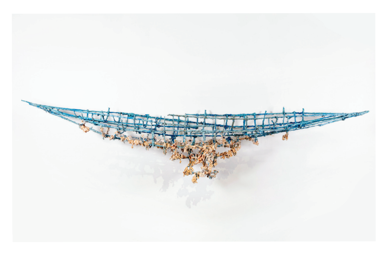
Apollo, steel, plaster, paint, silk, 95" x 20" x 17"