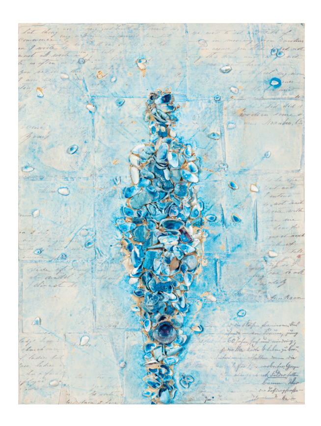
Corona (left) Carina (right), mixed media on panel, 16" x 12" each