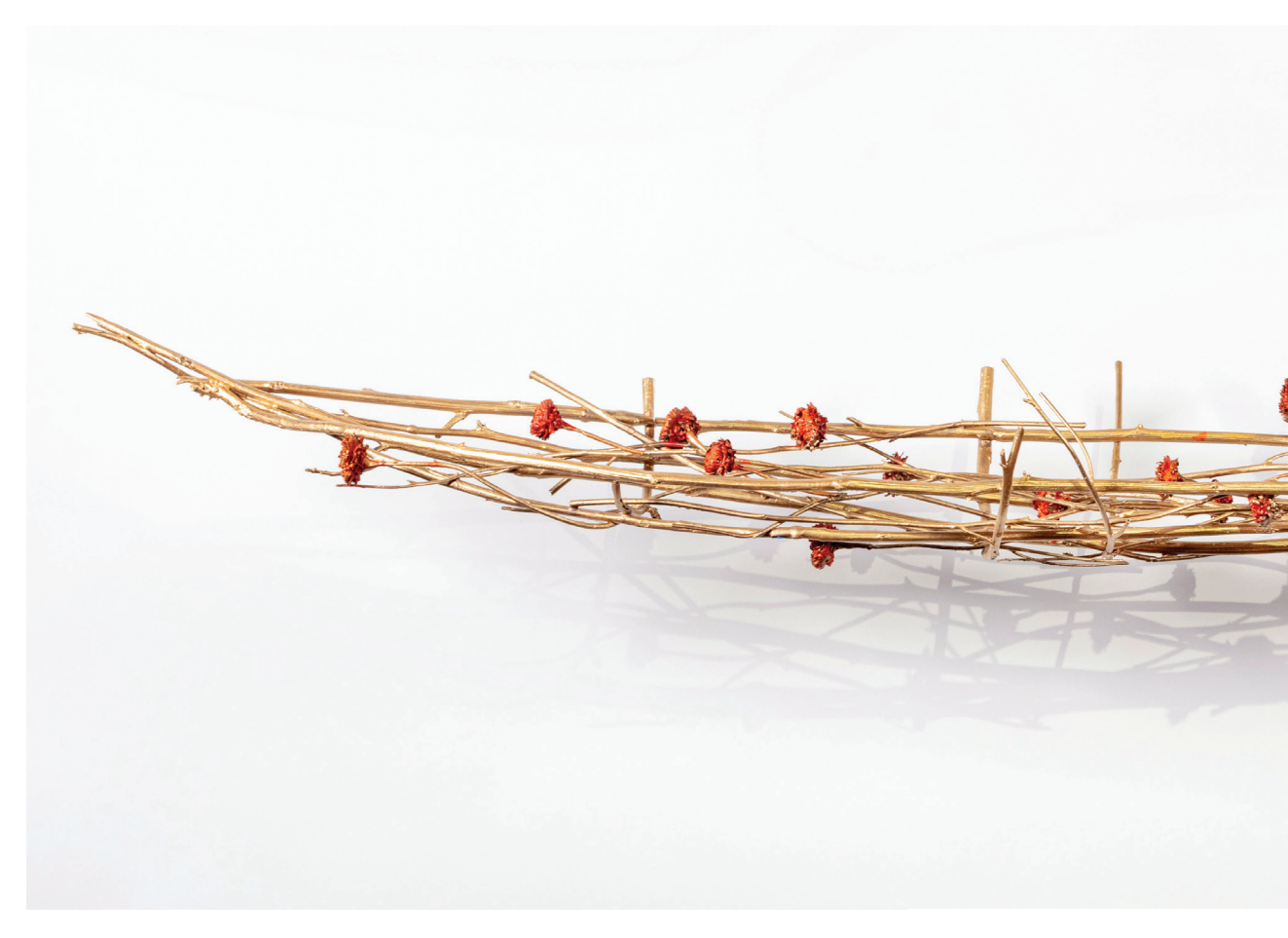
Marigold Offering, bronze, patina, watercolor, 71" x 17" x 17"