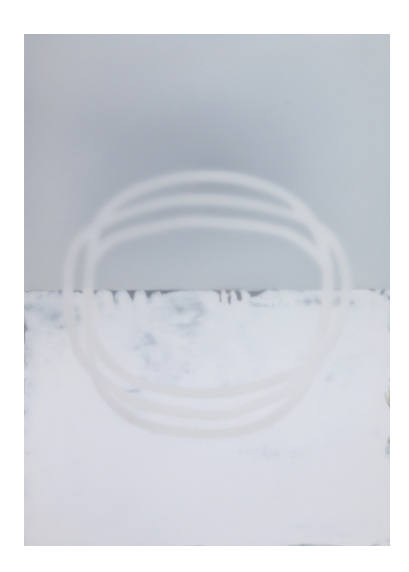
There is No Time XXVII, 2023 canvas, mixed media, 56" x 40"

518 Julia Street | New Orleans, LA 70130