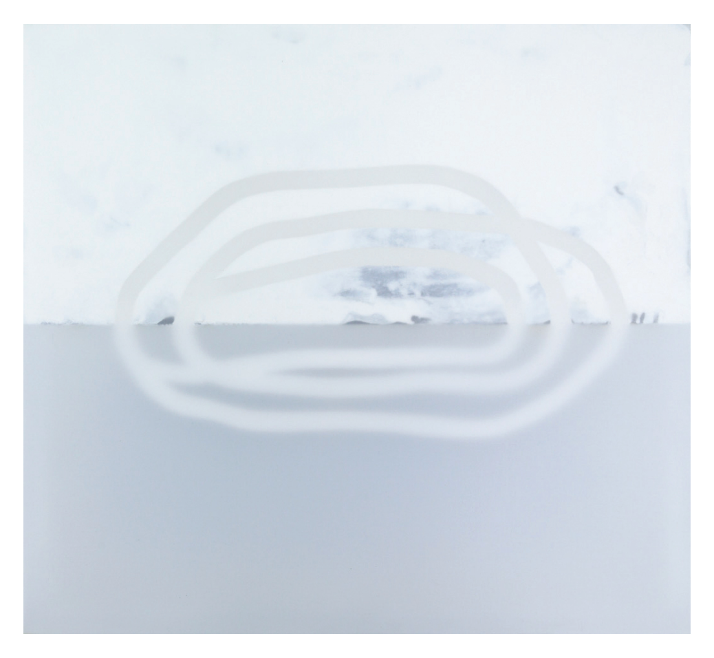
There is No Time XXII, 2023, canvas, mixed media, 33" x 36"