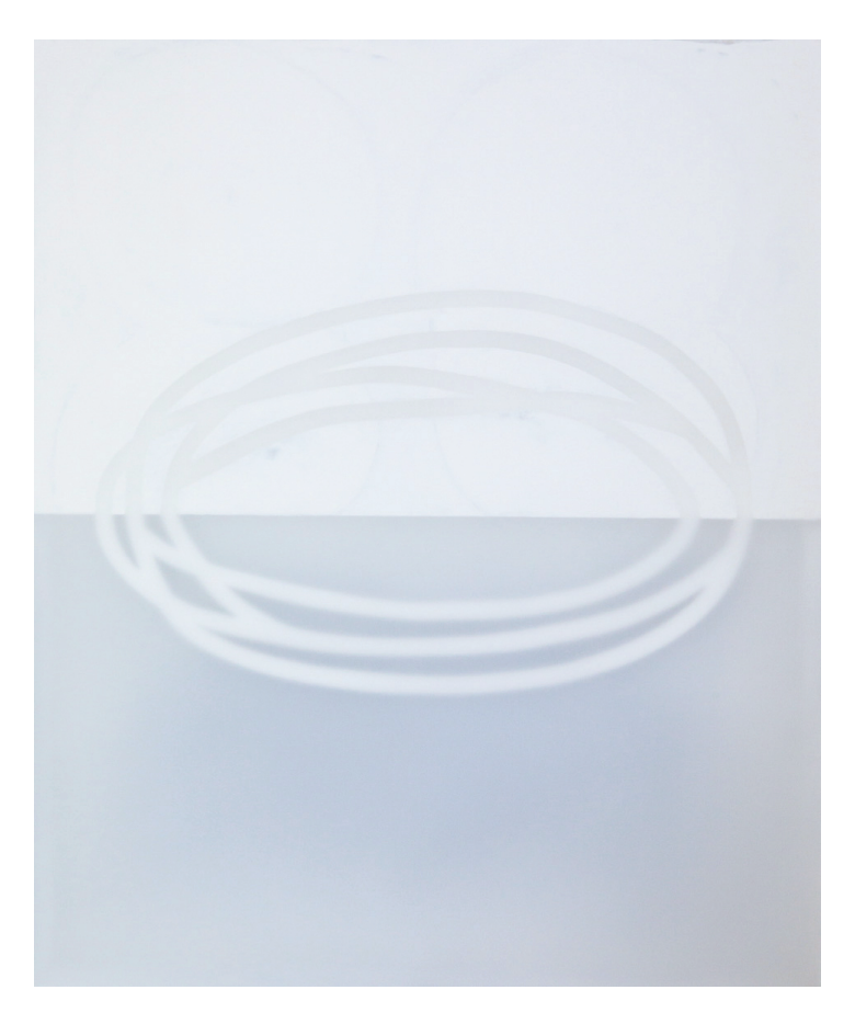
Motherland, 2023, canvas, mixed media, 72" x 60"