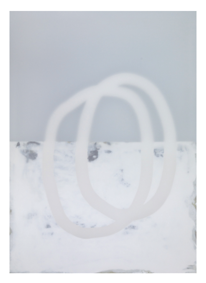
There is No Time XXIV, canvas, mixed media, 56" x 40"