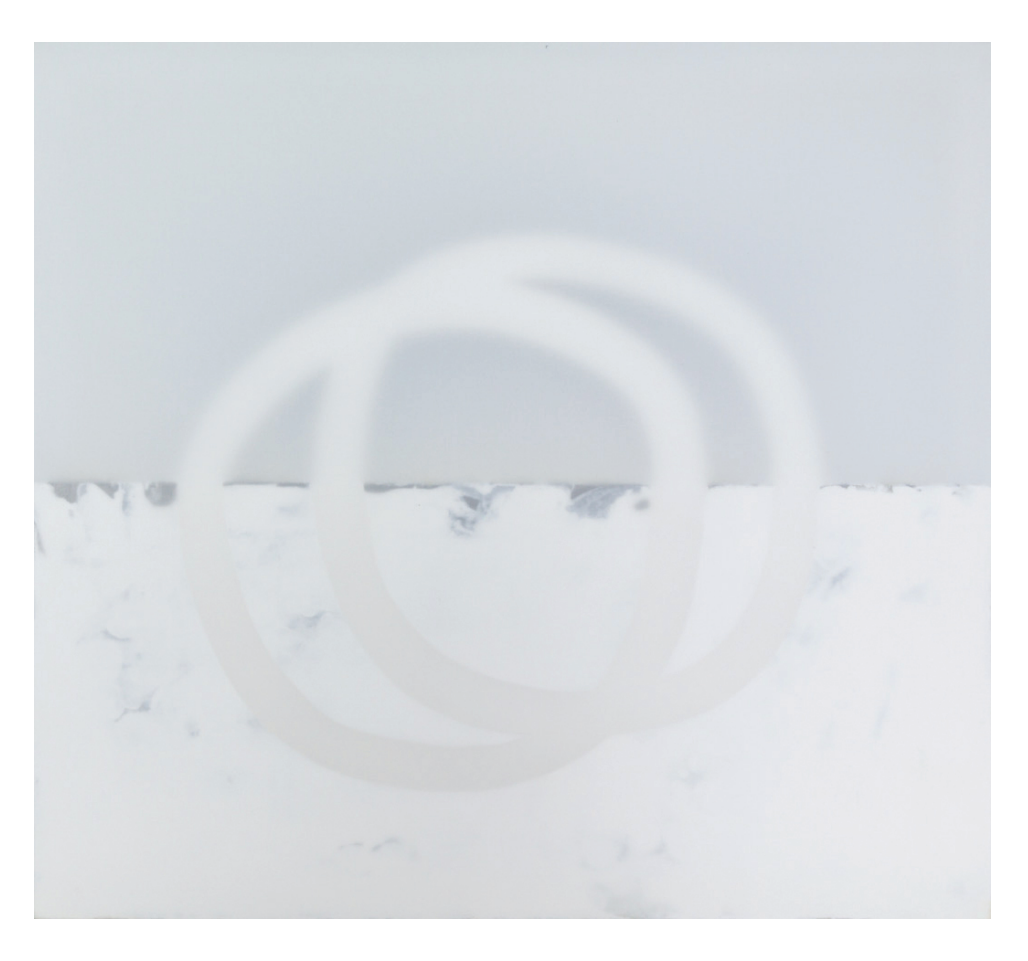
There is No Time XXIII, 2023, canvas, mixed media, 33" x 36"