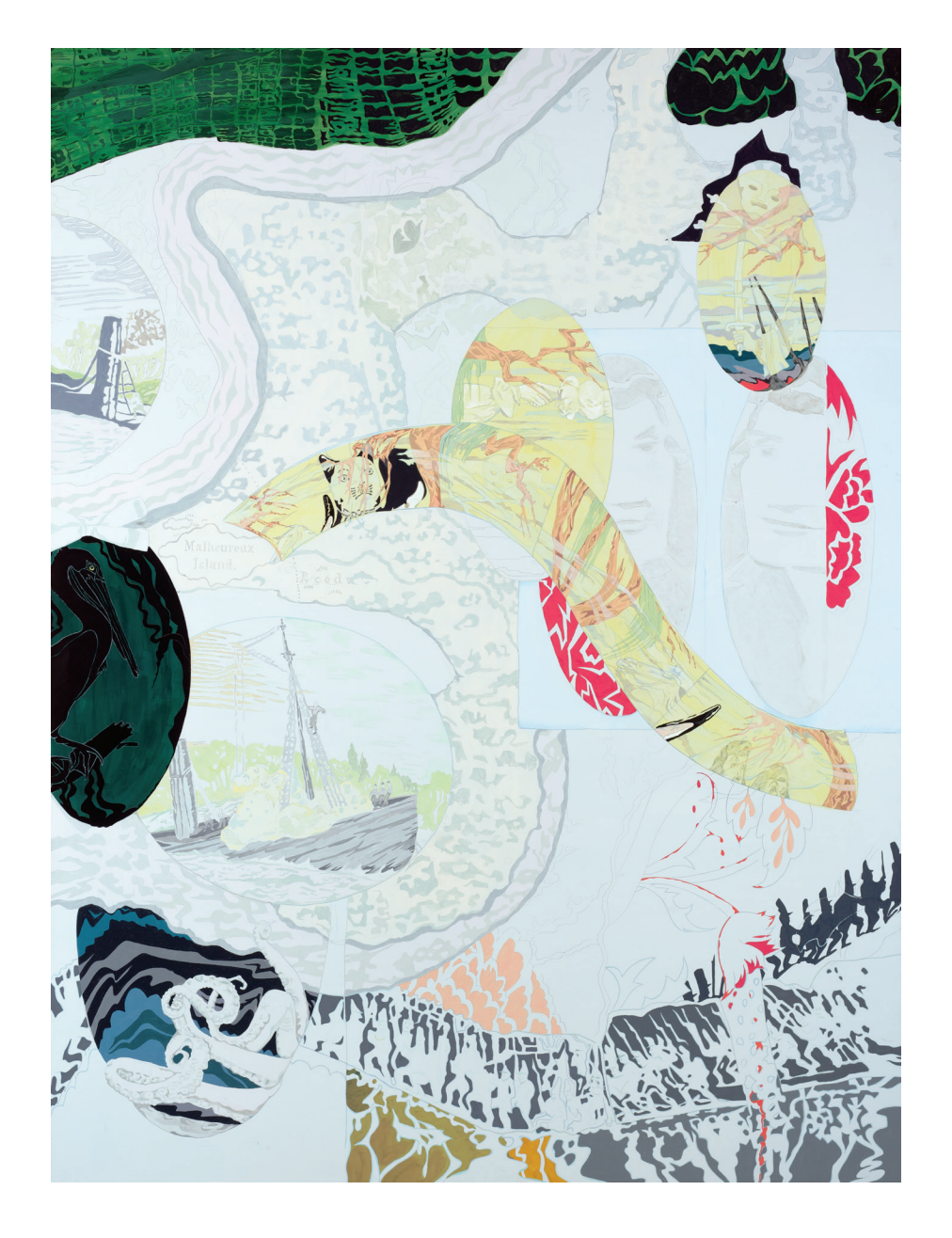
King of Barataria, gouache on panel, 48" x 36", 2015