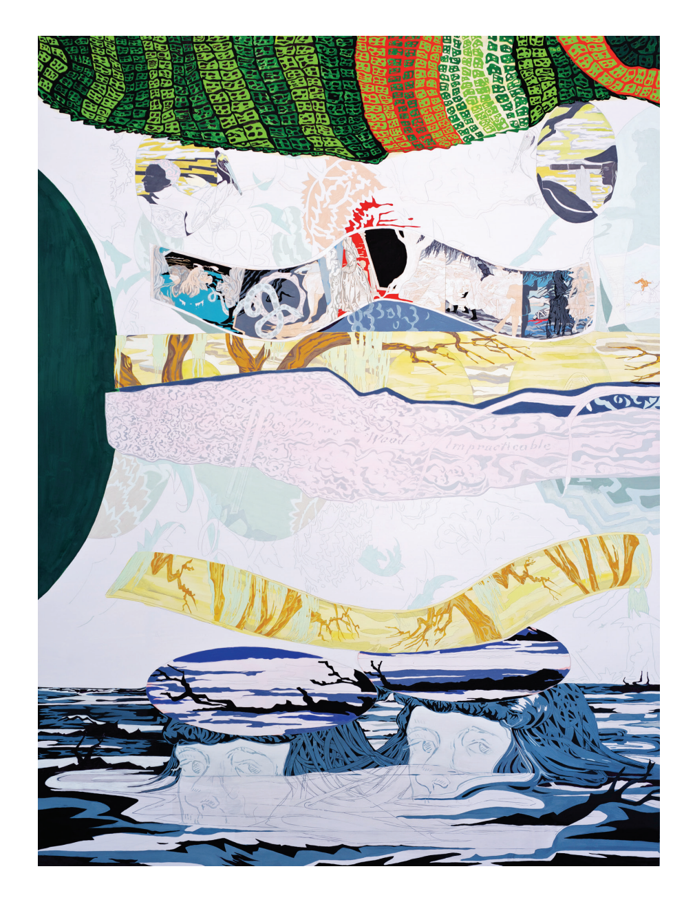
Inception: After Magafan, gouache on panel, 48" x 36", 2015