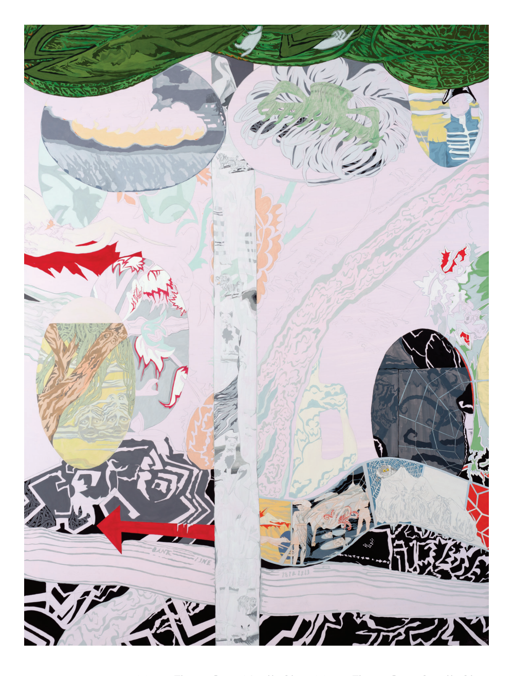
More Than One North Star, More Than One South Star gouache on panel, 48" x 36", 2015