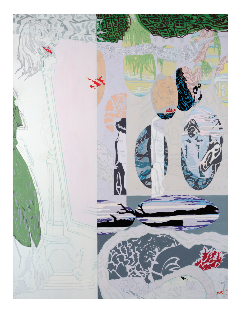
Wreck of Hermes, gouache on panel, 48" x 36", 2015