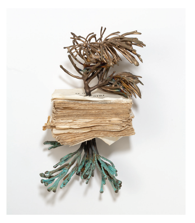
Passage cast bronze, paper, 9" x 7" x 5"