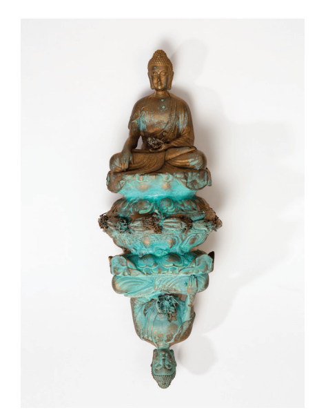
Reflective Buddha I cast bronze, 13" x 5" x 5"

ARTWORK © RIANE BEDSOLE 2018 CATALOG © CALLAN CONTEMPORARY 2018