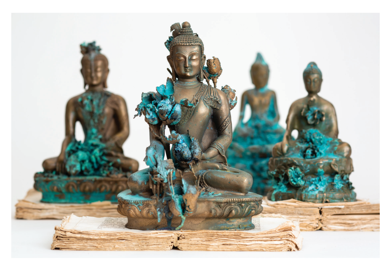
Philosophers I - IV cast bronze, paper, dimensions variable