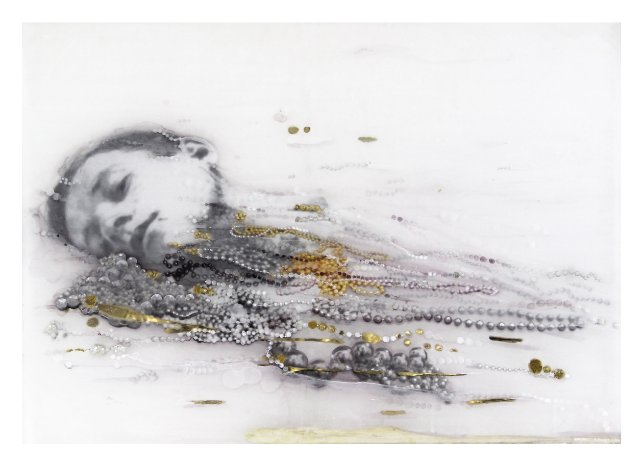
Orpheus, carved, painted and mirrored acrylic glass, silver and gold leaf, paper, 25.5" x 36" x 1"