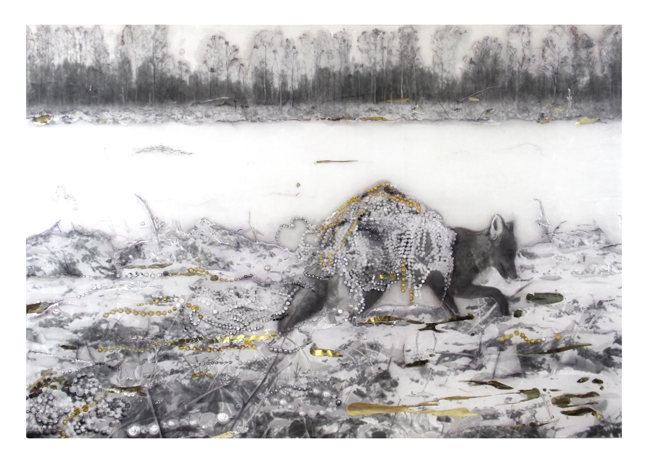
Pearl River, painted and mirrored acrylic glass, silver and gold leaf, paper, 48" x 70" x 1"