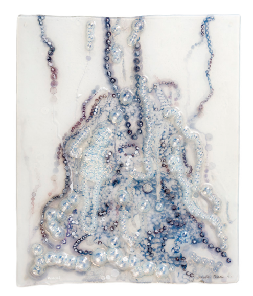
Detail: Perch II , kiln formed, engraved, painted and silvered glass, paper, 41" x 17" x 1"

518 Julia Street | New Orleans, LA 70130