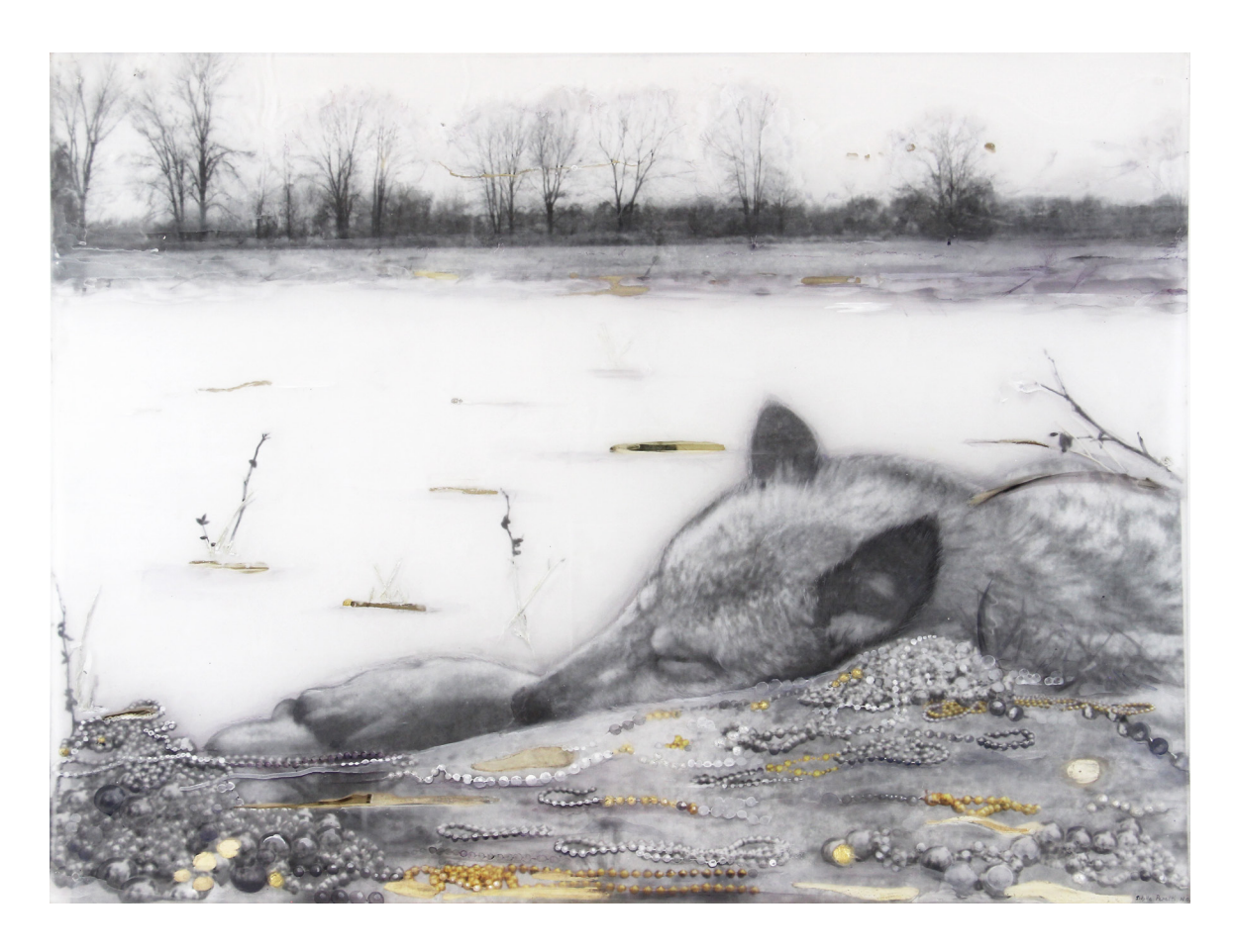
Coyotito, carved, painted and mirrored acrylic glass, silver and gold leaf, paper, 36" x 48" x 1"