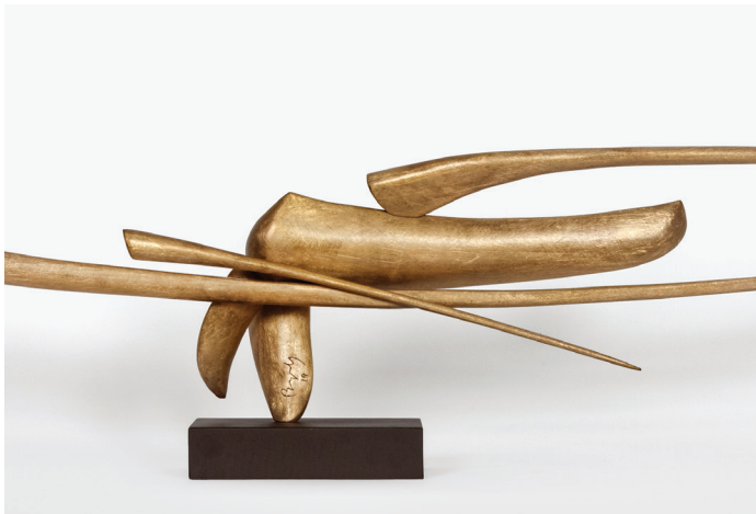
IPRIP (detail) welded bronze, 11" x 57" x 7", 2019

518 Julia Street | New Orleans, LA 70130