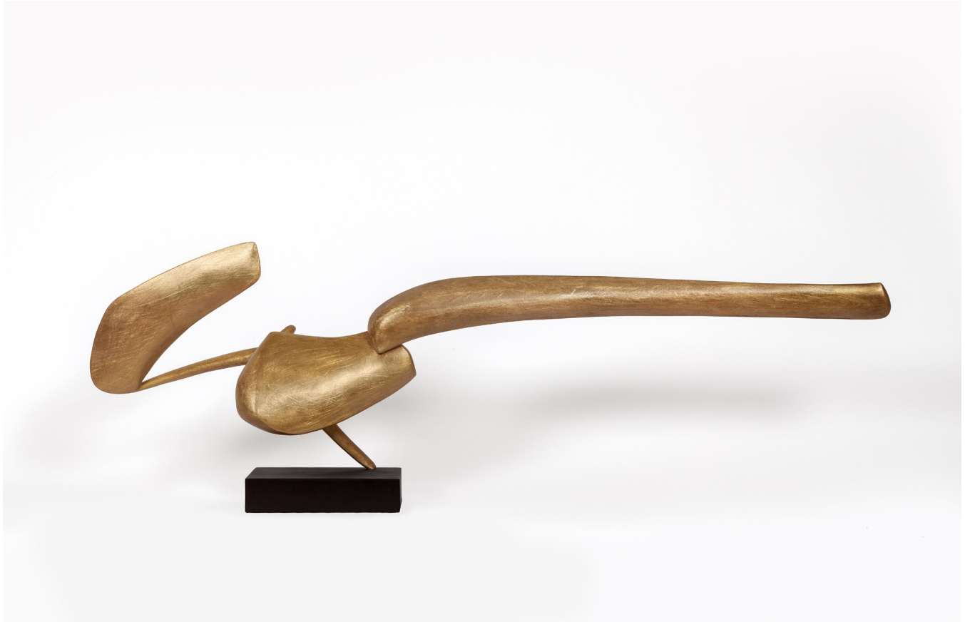
BITA , welded bronze, 14" x 42" x 7", 2019