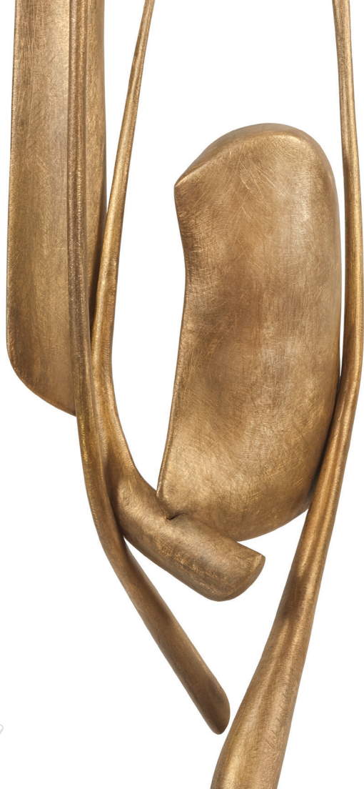
APAITA, (left) and detail (right) welded bronze, 58" x 10" x 7", 2019