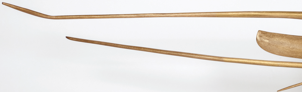
IPRIP , welded bronze, 11" x 57" x 7", 2019