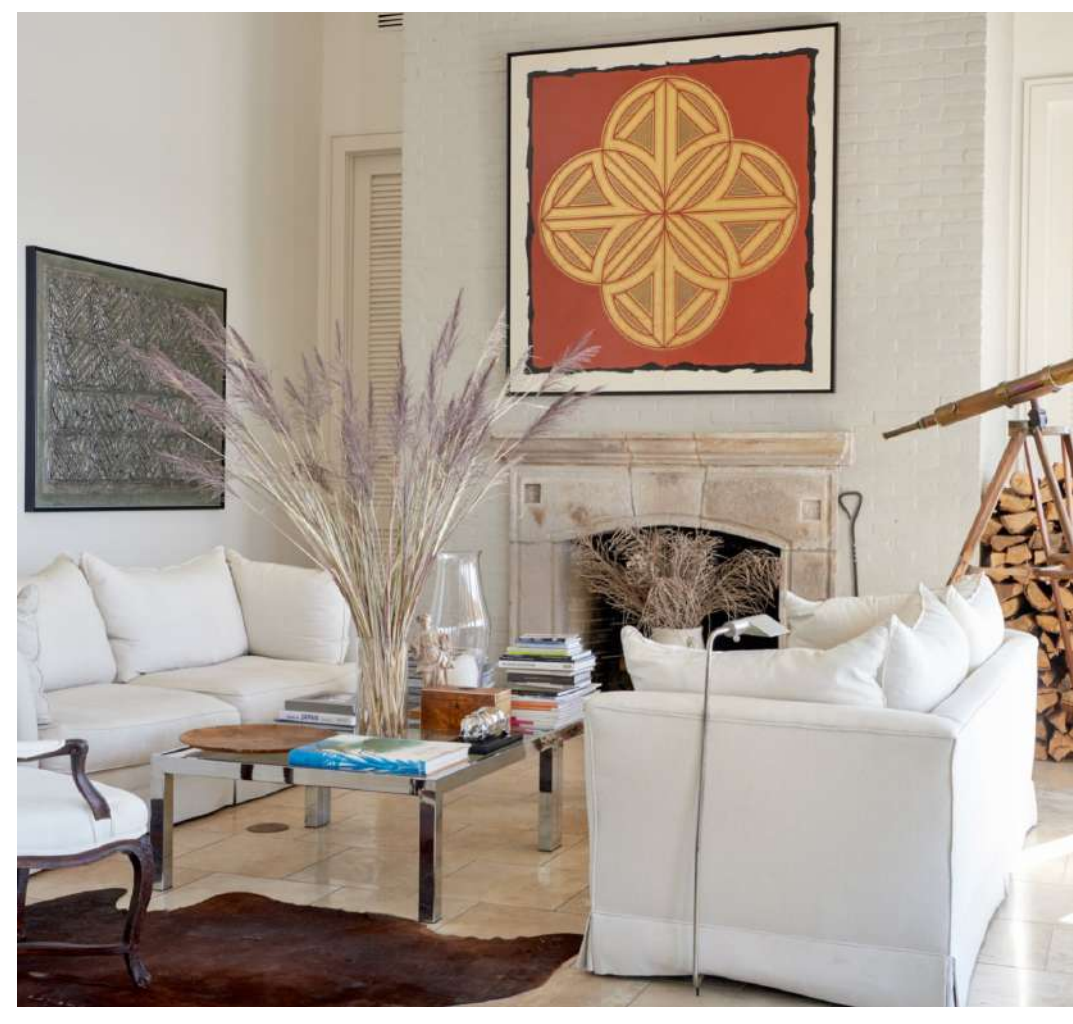
Twenty-two-foot-tall ceilings run through the core of the artist's home, allowing room for large-scale works. An engraved gold-leaf painting from Dunbar's Coin Du Lestin period dominates the living room. Paul Costello

For Dunbar, art is at its best when it straddles the line between handsomeness and brutality. He offers as an example one of his own pictures, from his rag period, that practically covers an entire wall in the bedroom. "I dropped rags from the balcony at my studio — they landed better that way than if you placed them ... And sometimes it all just really worked. I find you lose the energy when you go back in and add things." His work has found its way into multiple museums since the '50s — including the New Orleans Museum of Art (NOMA), where he