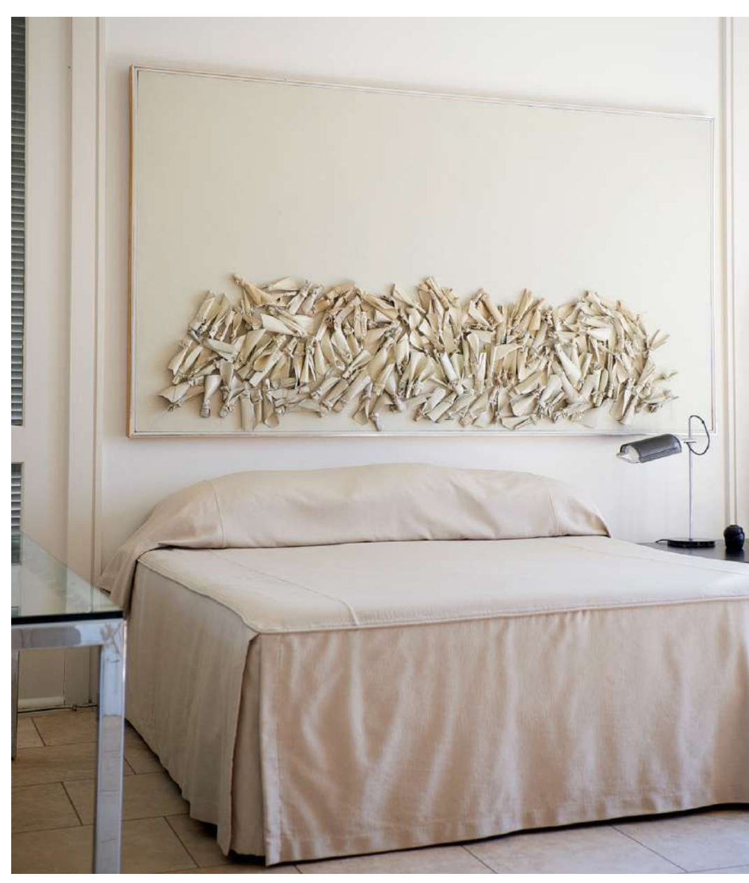
A nine foot-long painting from Dunbar's 1984 Rag Series collection hangs above his bed. Paul Costello

Today, the 89-year-old artist is shockingly nimble, moving purposefully between the cottage