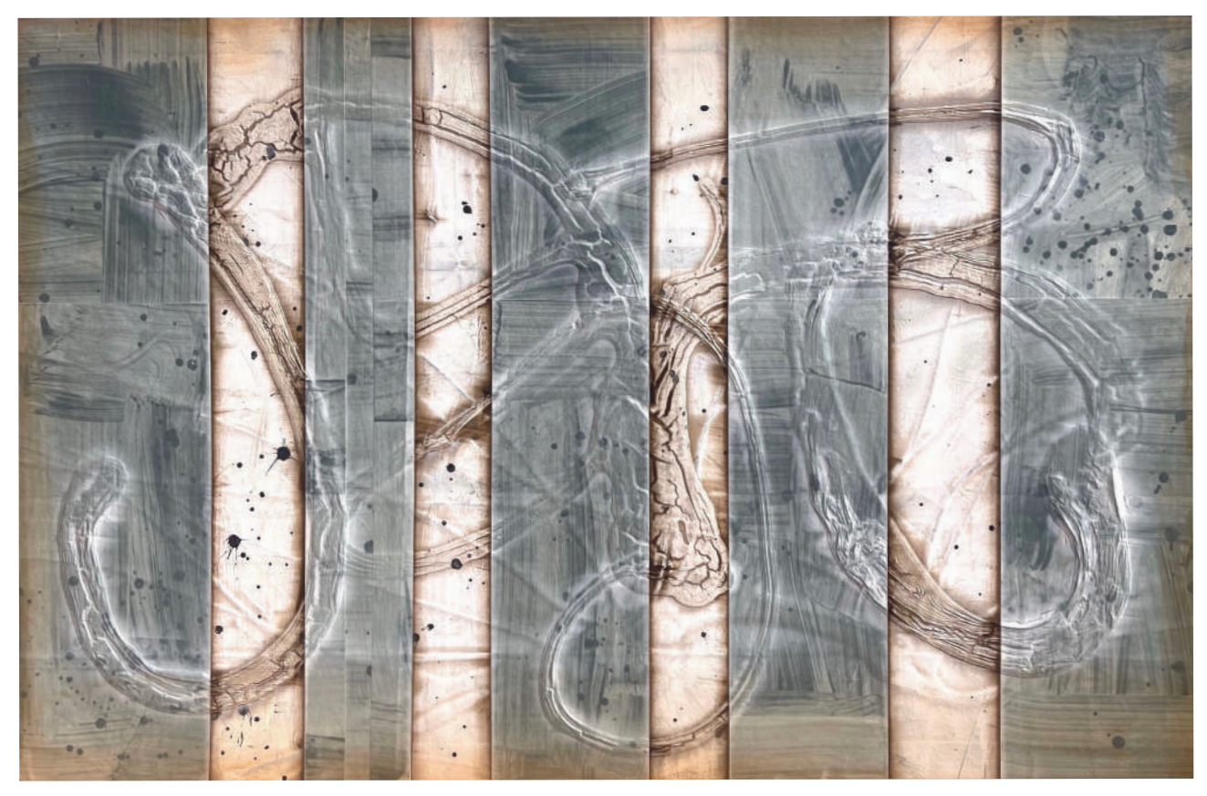
Sagebands III, acrylic on panel, 40" x 60"