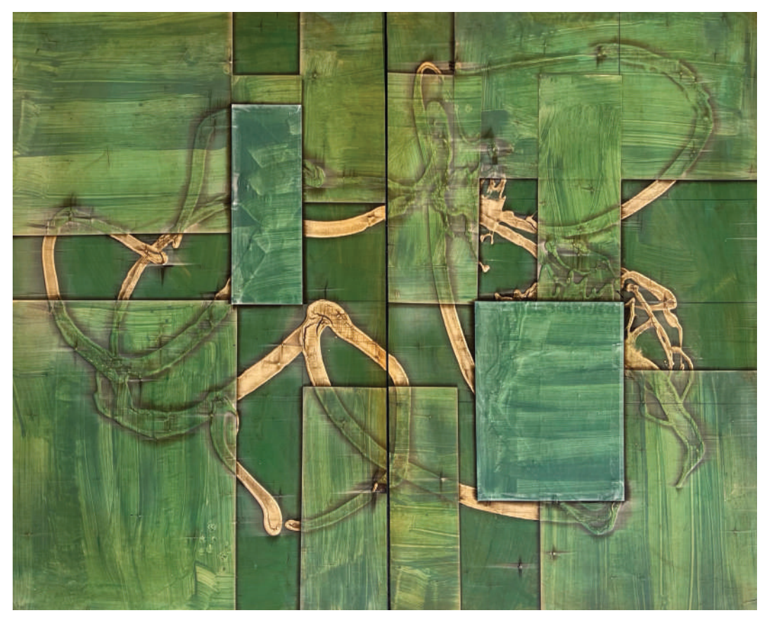
Spring ield II, acrylic on panel, 48" x 60"