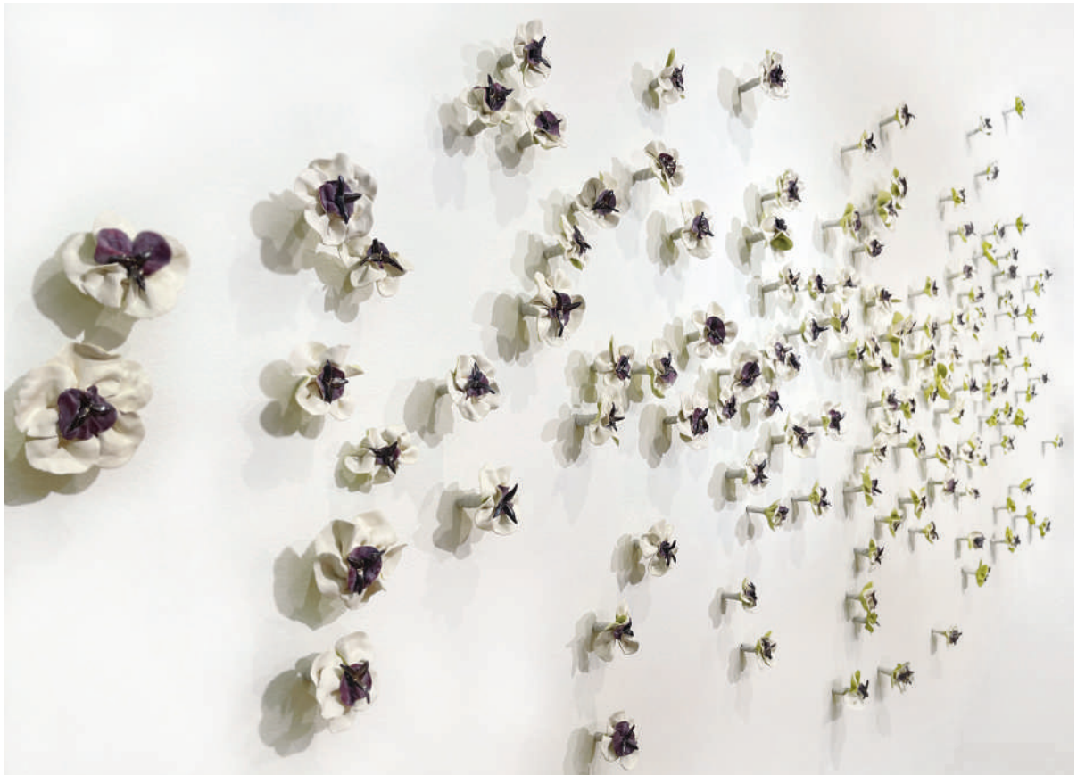
Wild Hibiscus Floral Wall Installation 2023, ceramic, glaze, 80" x 150" x 3" (dimensions variable)