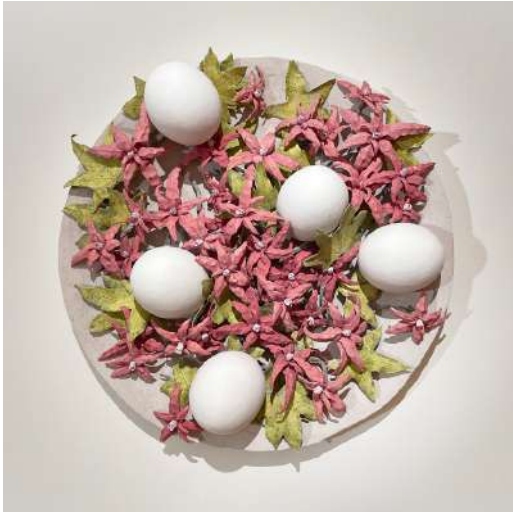
Still Life with Lilies, Eggs and Leaves 2023 ceramic, glaze 26" x 26" x 7"

518 Julia Street | New Orleans, LA 70130