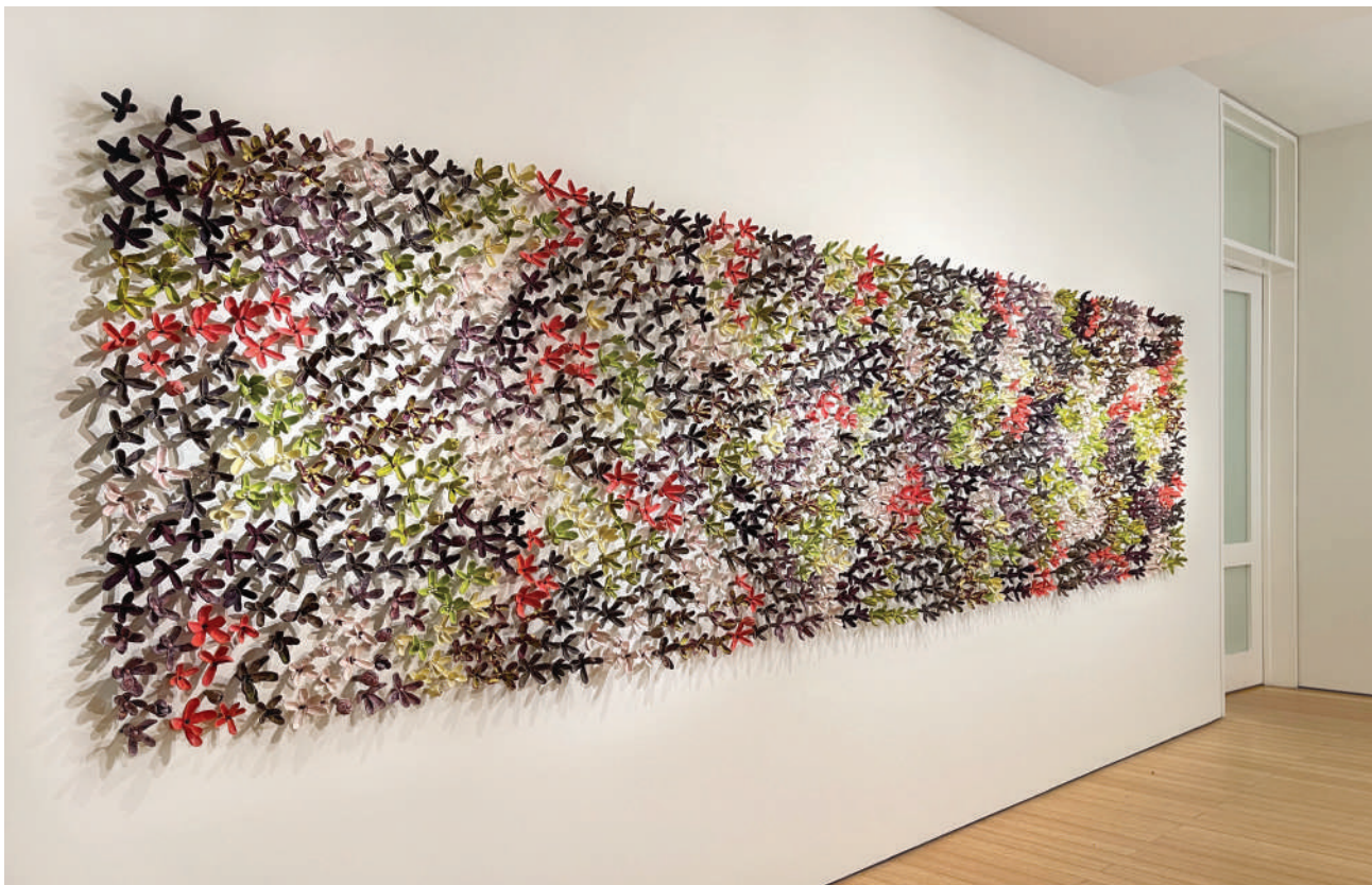
Better Homes and Gardens 2023 , ceramic, glaze, 52" x 198" x 4" (dimensions variable) (Floral Wall Installations sold as individual sets)