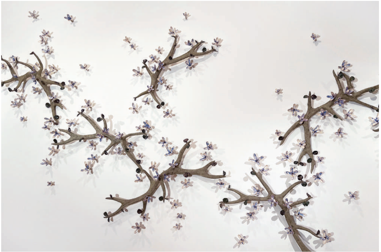
Green Antler Set with Amethyst Quartz Flowers (detail), ceramic, glaze, 104" x 204" x 8" (dimensions variable)