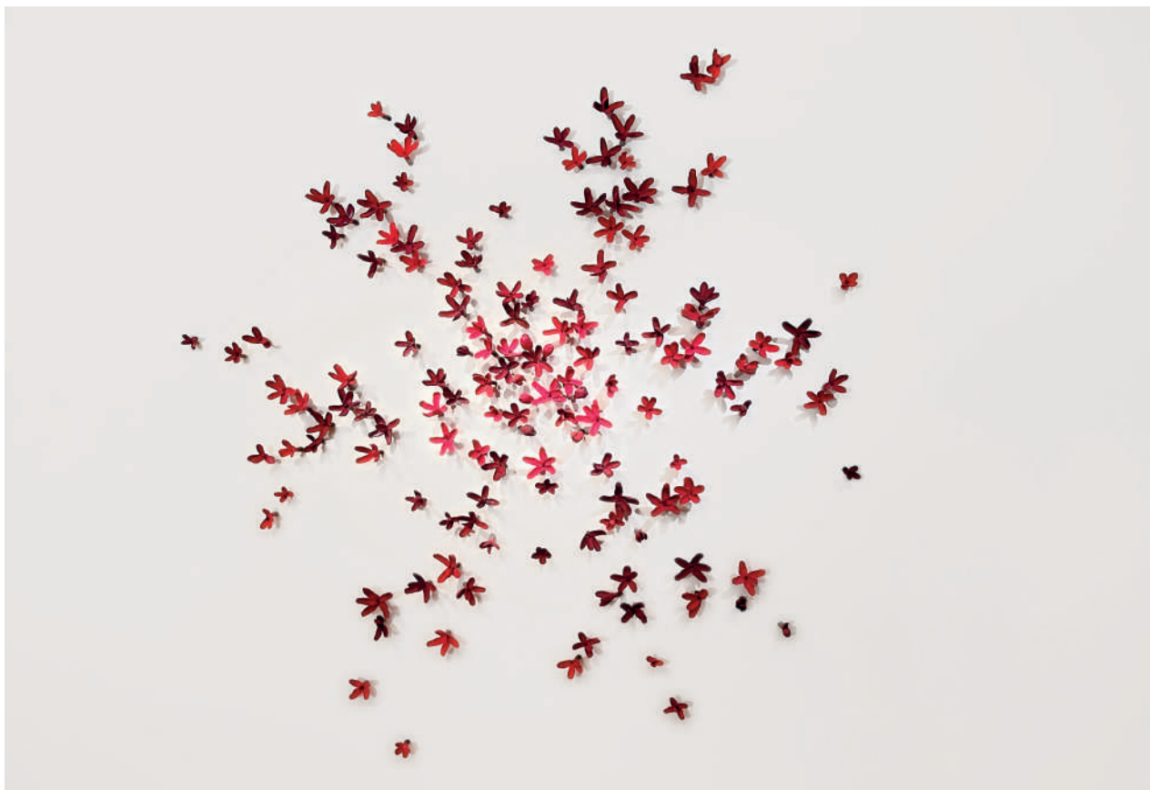
Variegated Red Floral Wall 2023, ceramic, glaze, 81" x 72" x 3.5" (dimensions variable)