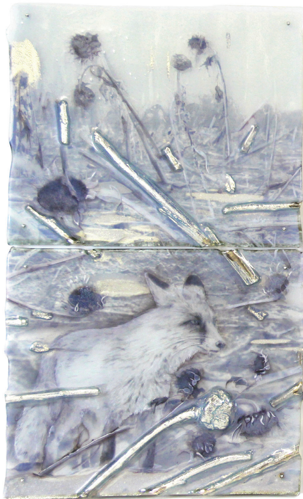
Home Range , 2021 kiln formed glass, engraved, painted, silvered, paper applique, 35" x 63" x 1-1/2"