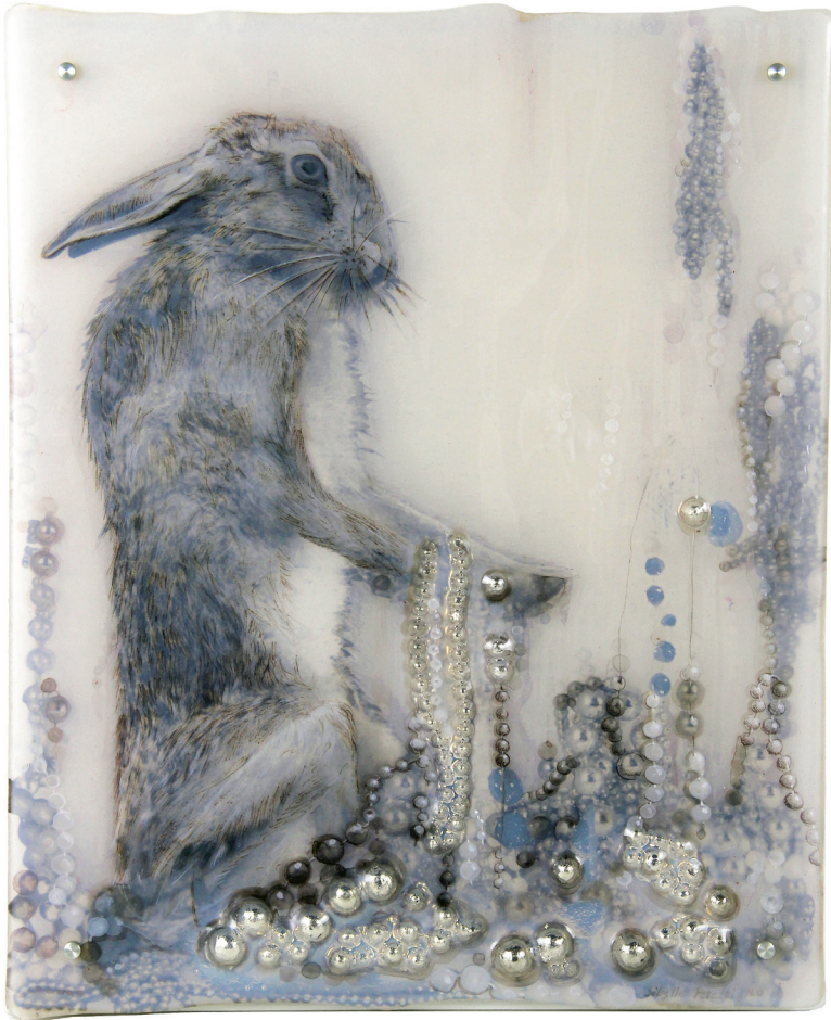
left: Hase , 2021 kiln formed glass, engraved, painted, silvered, paper applique, 20" x 17" x 1"