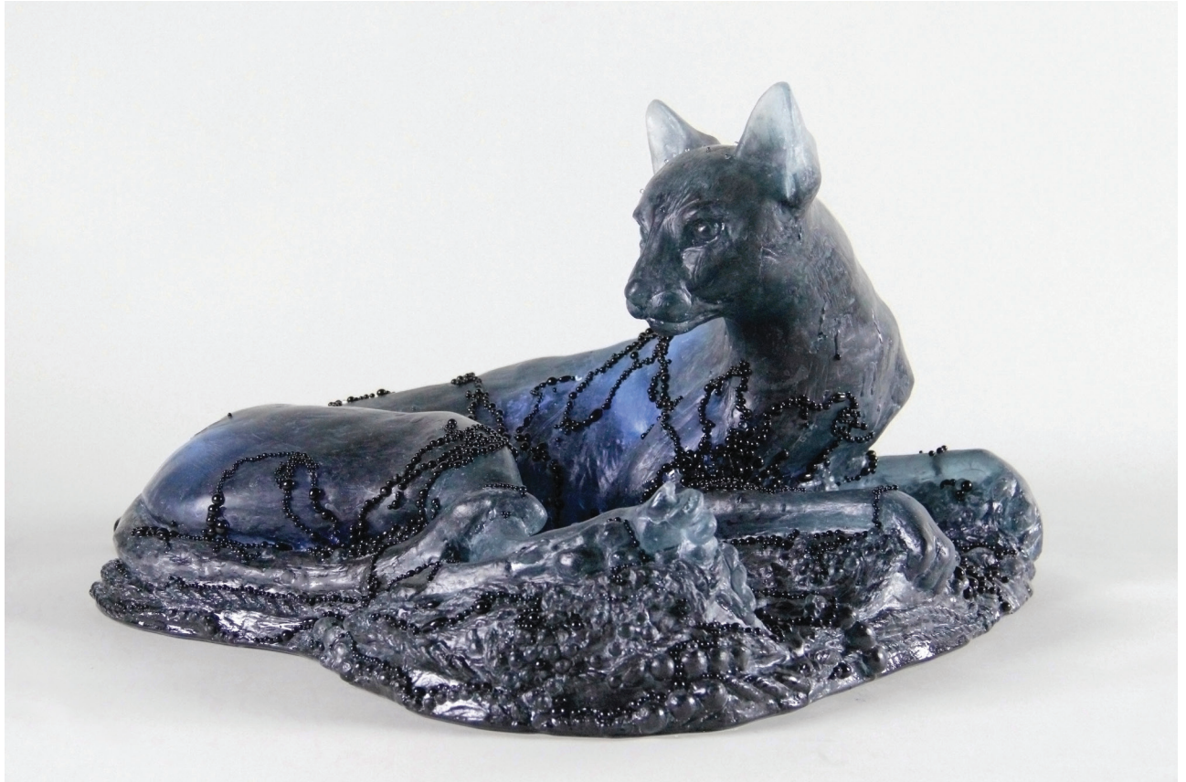
Panther , 2020, cast glass, 15" x 25" x 20"