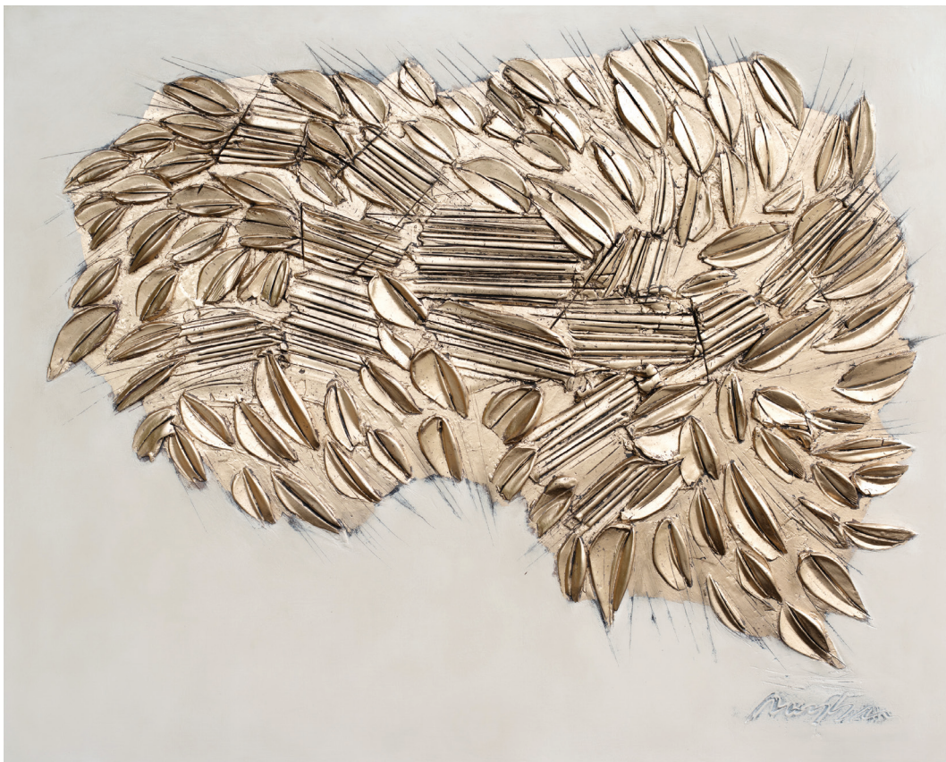
Rouville CIX , moon gold over black, taupe and white clay, 41.5" x 51.5"