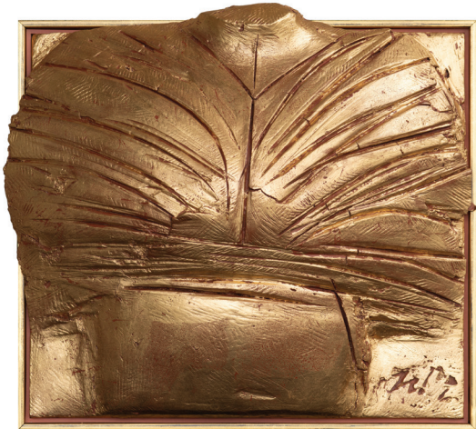
Idun - Deity Series , red gold over mauve clay 13.5" x 15" x 4"

518 Julia Street | New Orleans, LA 70130