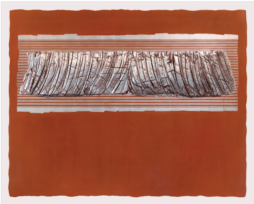
Torregano - Surge Series , palladium over red and white clay, 49.5" x 61.5"