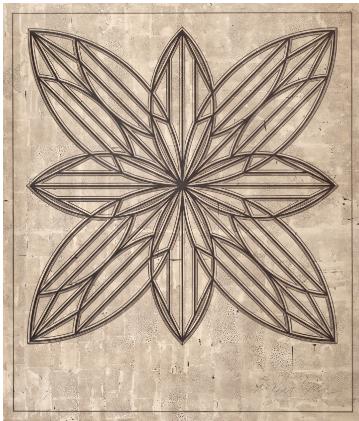
Coin Du Lestin CLXXXIX, moon gold, brown clay, 50" x 44"