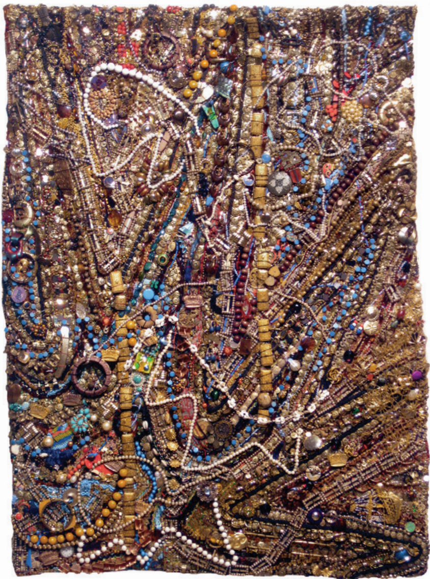
Bower mixed media, 49" x 36"