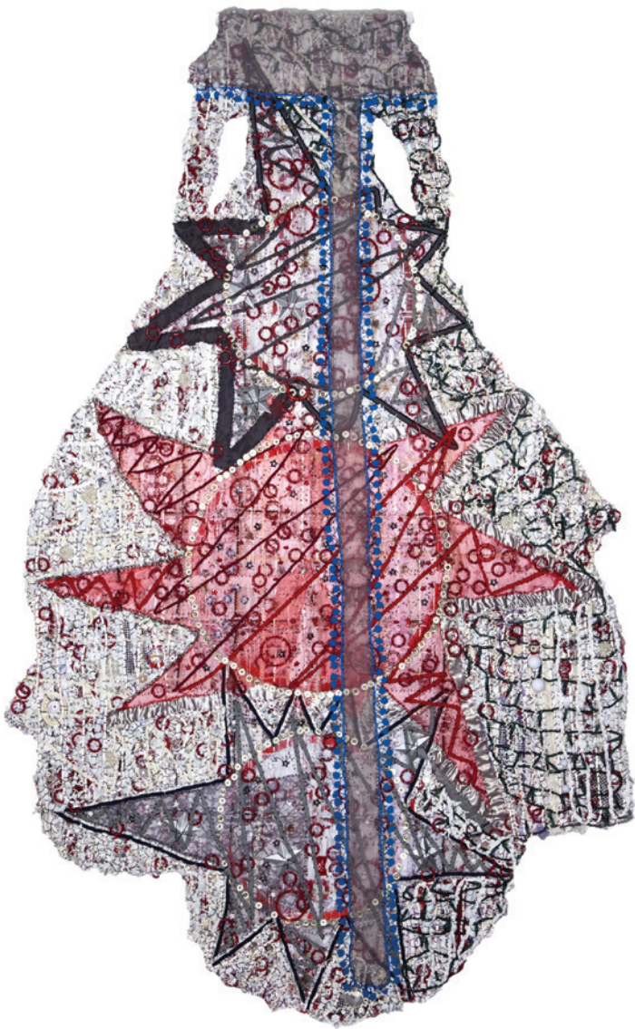
Leucosia mixed media, 102" x 65"