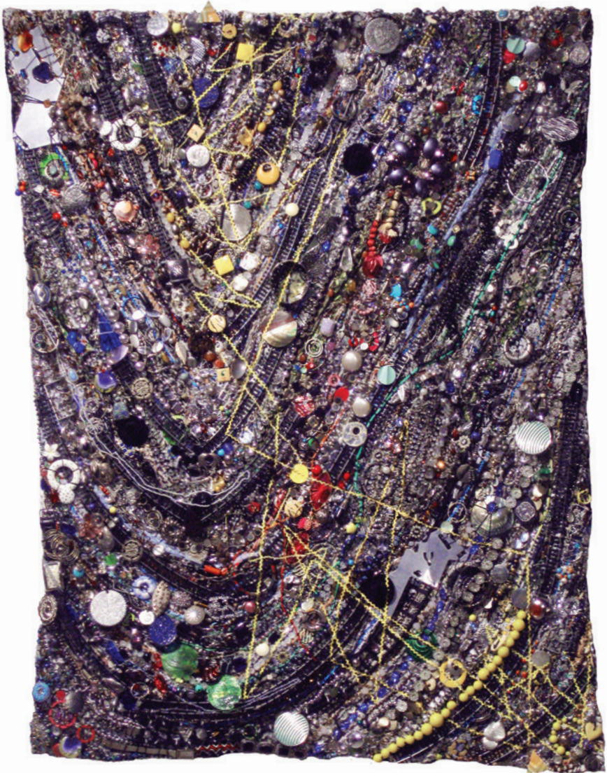
Twin Flame mixed media, 50" x 37"