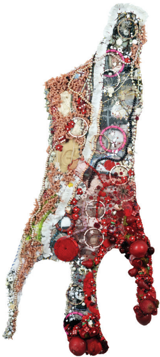
Leto mixed media, 50" x 18" x 3"