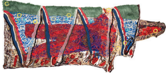
Vestige , mixed media, 83" x 38"

518 Julia Street | New Orleans, LA 70130