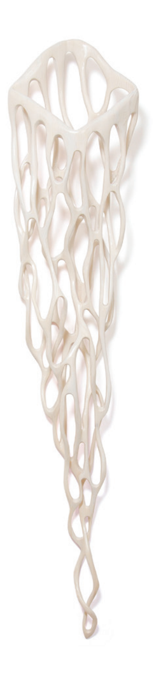
White Vessel III, pine, 84" x 19" x 9" \,