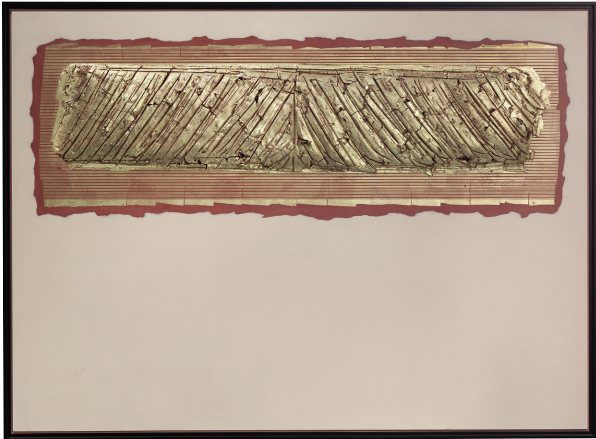
Narcisse , 16 karat pale over mauve and white clay with die keen, 50" x 68"