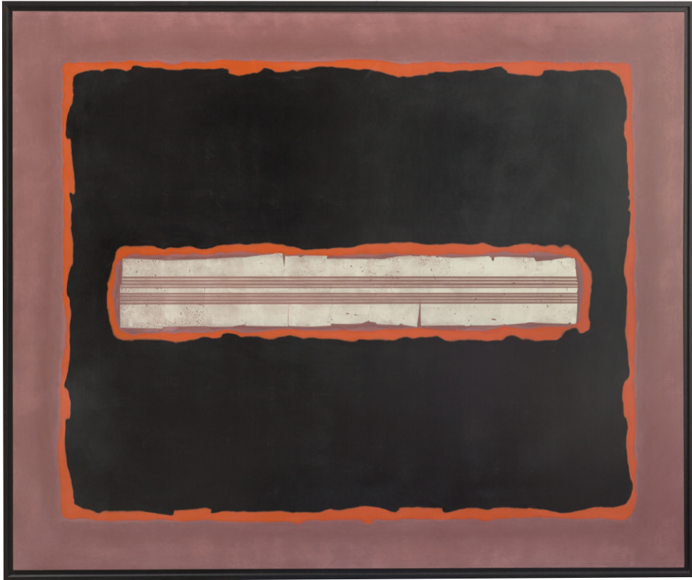
Laurent , palladium over red, mauve and black clay, 45.5" x 54.5"