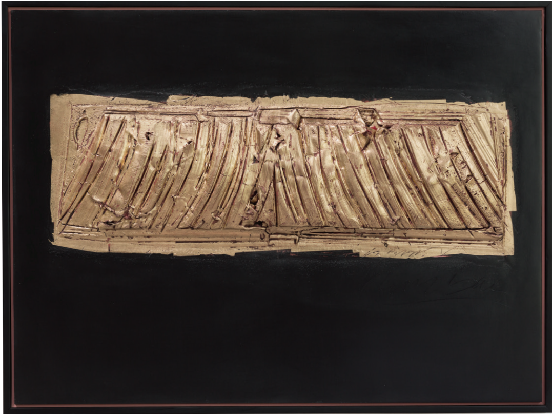
Des Cannes , moon gold over black and mauve clay with die keen, 21" x 28"