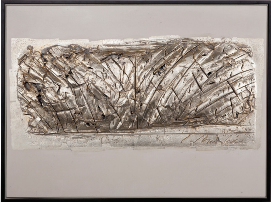
De Glaises , white gold over gray and white clay with die keen, 21" x 28"