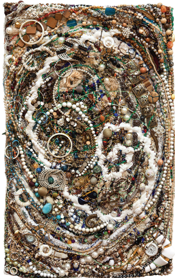
Sunspot , mixed media, 32" x 20"