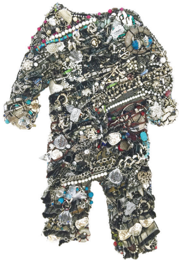
Folie a' Deux mixed media, 23" x 16"

518 Julia Street | New Orleans, LA 70130