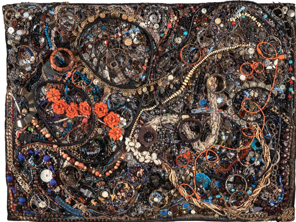
Humors, mixed media, 30" x 40"