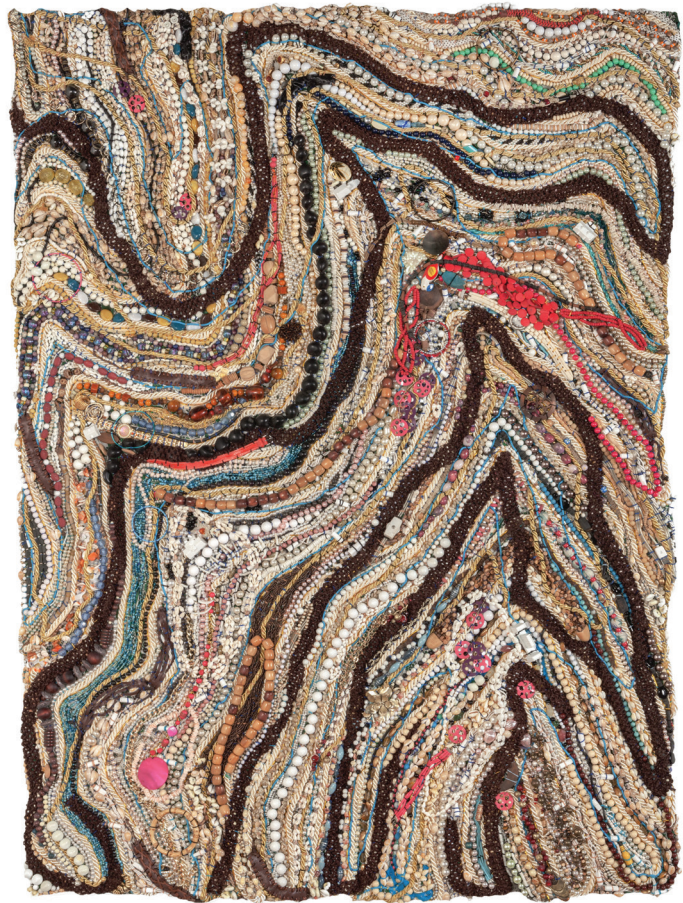
Blind Alley , mixed media, 60" x 42"