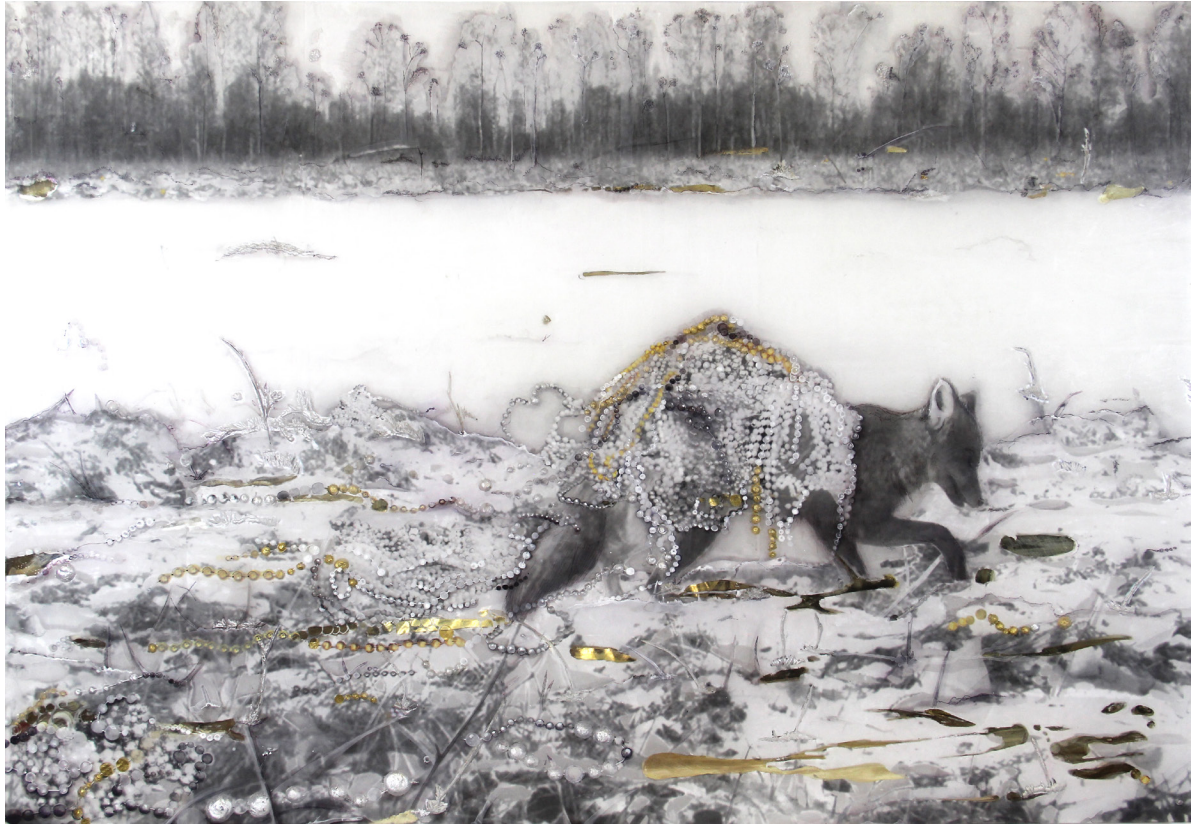
Pearl River , painted and mirrored acrylic glass, silver and gold leaf, paper, 48" x 70" x 1"