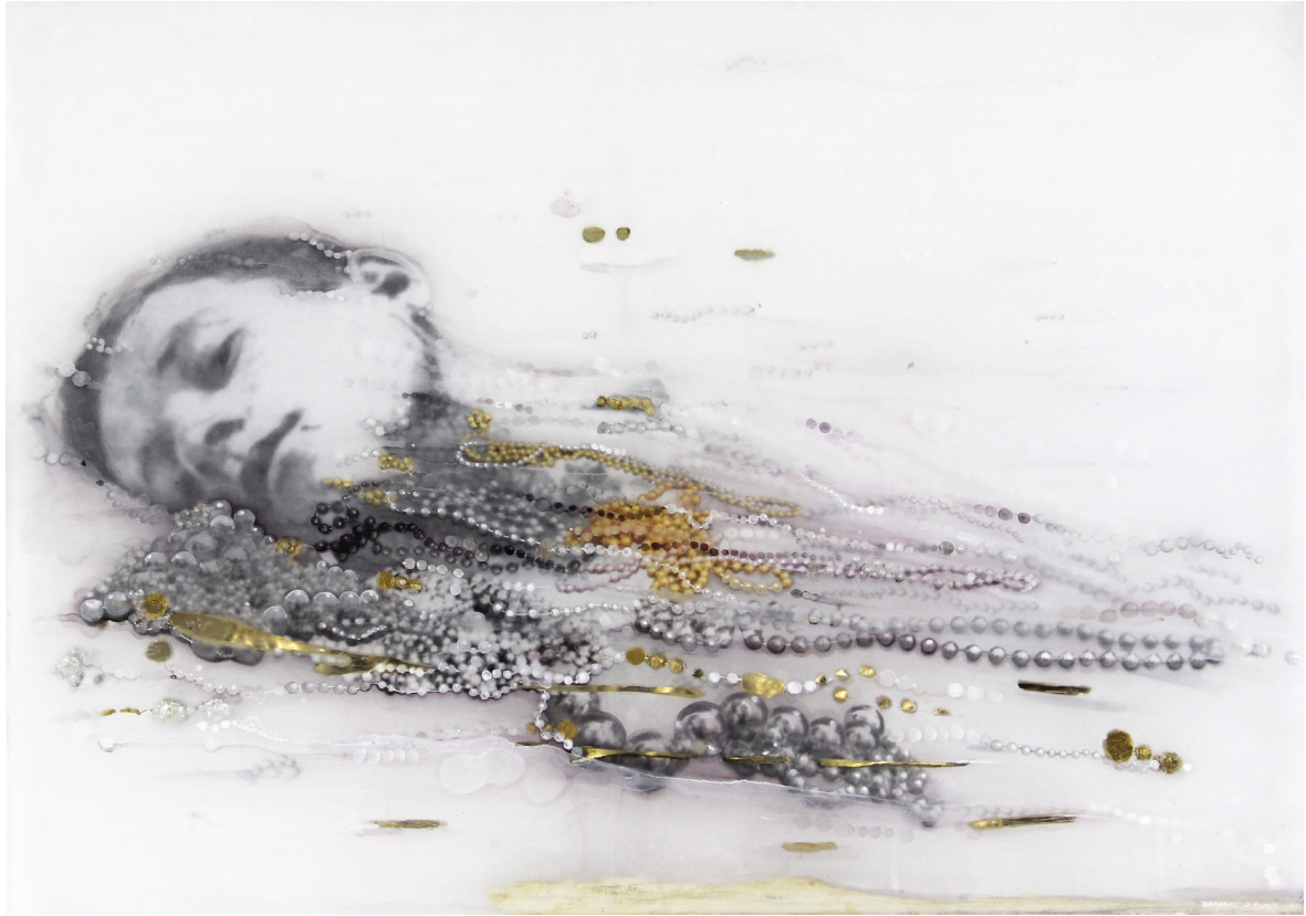
Orpheus , carved, painted and mirrored acrylic glass, silver and gold leaf, paper, 25.5" x 36" x 1"