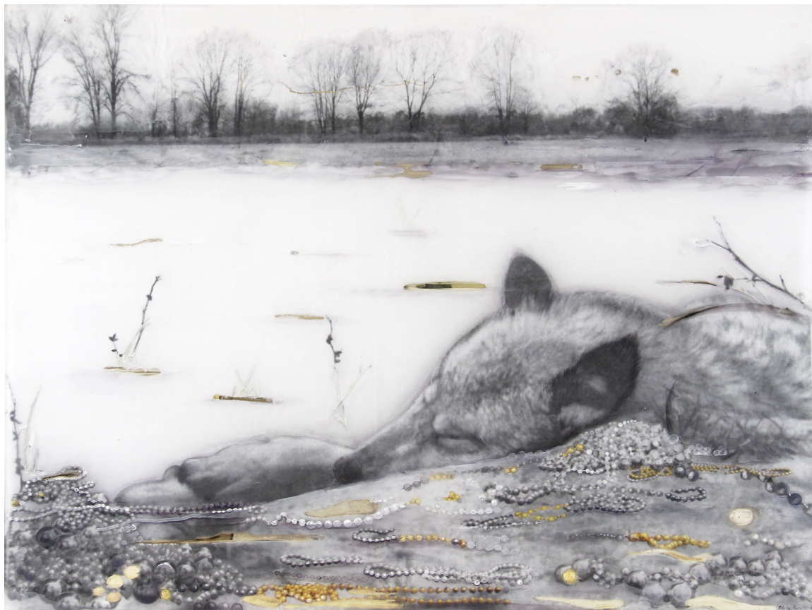
Coyotito , carved, painted and mirrored acrylic glass, silver and gold leaf, paper, 36" x 48" x 1"