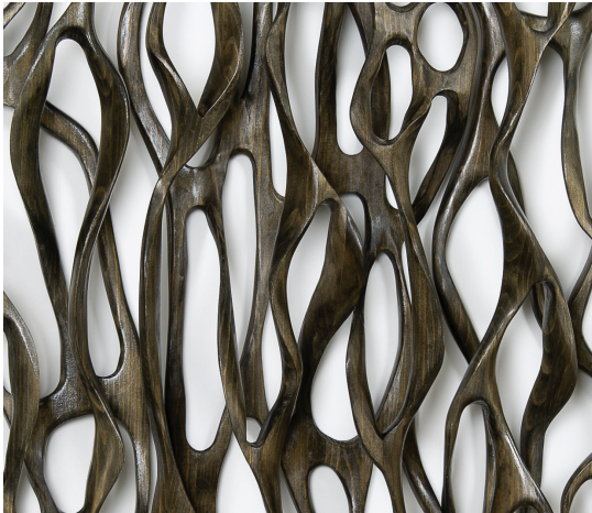
Charcoal Delicate With Loose Loops II (detail) pine, 53" x 57" x 6"

518 Julia Street | New Orleans, LA 70130