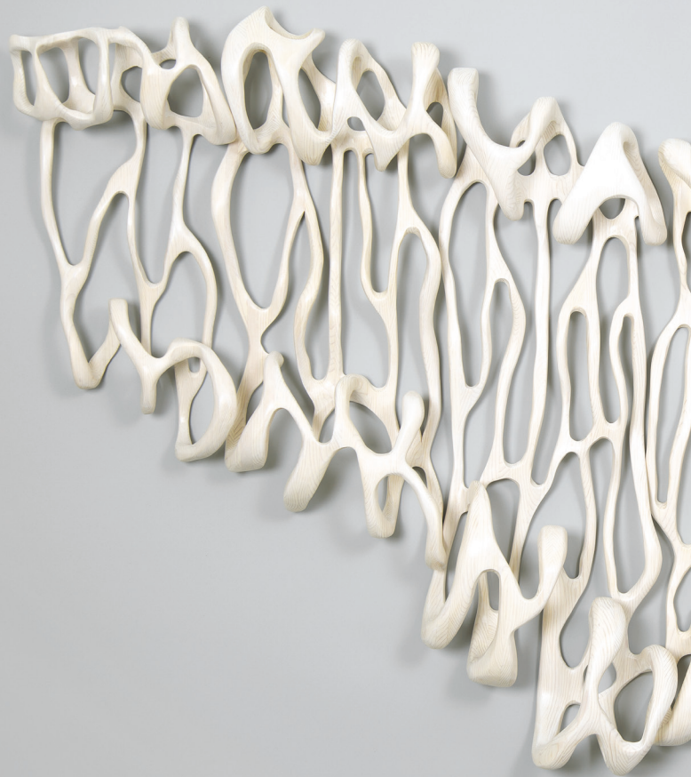
Full Circle, pine, 59" x 98" x 9"