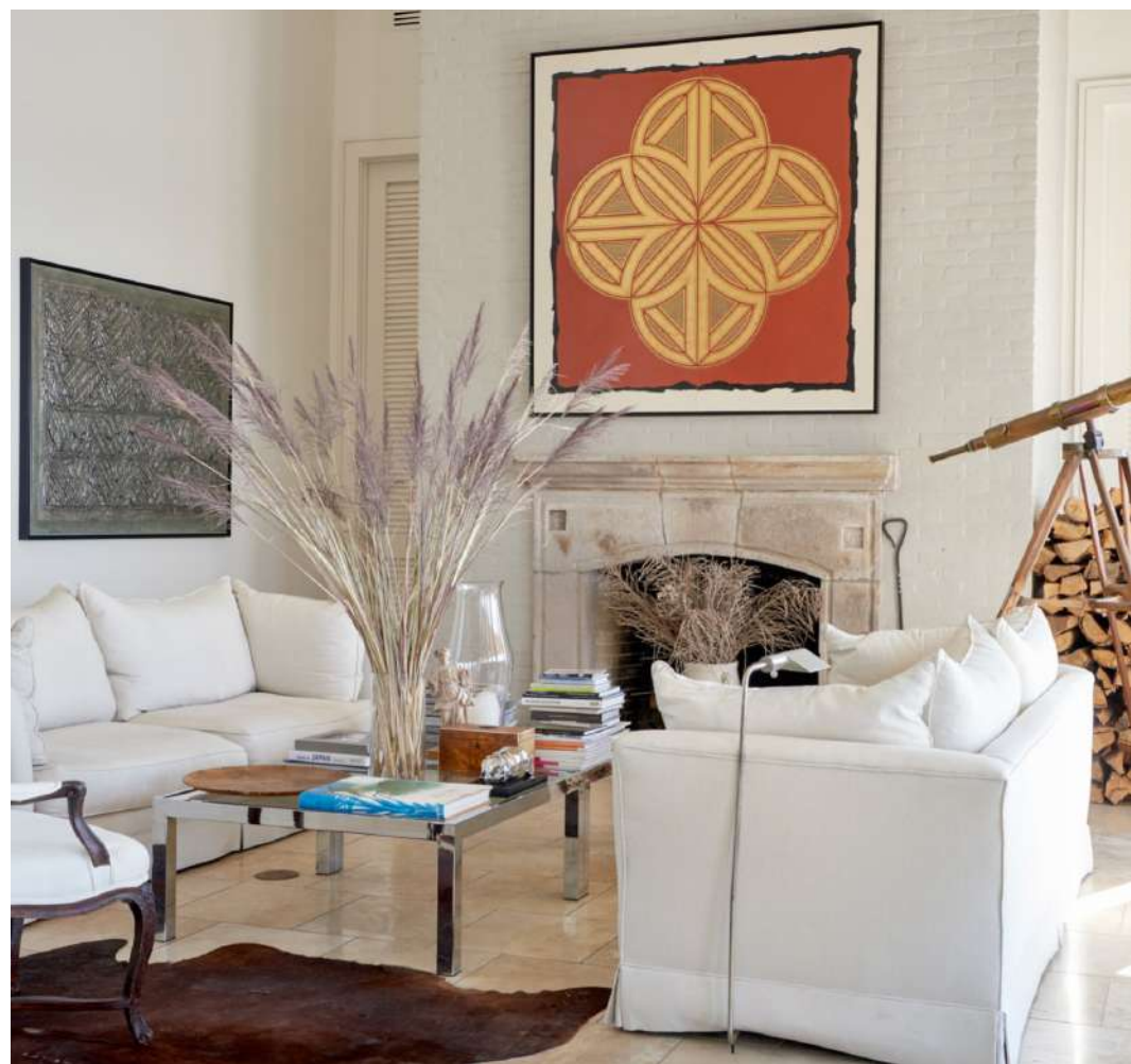
Twenty-two-foot-tall ceilings run through the core of the artist's home, allowing room for large-scale works. An engraved gold-leaf painting from Dunbar's Coin Du Lestin period dominates the living room. Paul Costello

His work has found its way into multiple museums since the '50s — including the New Orleans Museum of Art (NOMA), where he