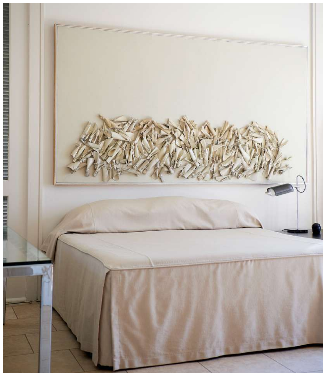
A nine foot-long painting from Dunbar’s 1984 Rag Series collection hangs above his bed. Paul Costello

Today, the 89-year-old artist is shockingly nimble, moving purposefully between the cottage