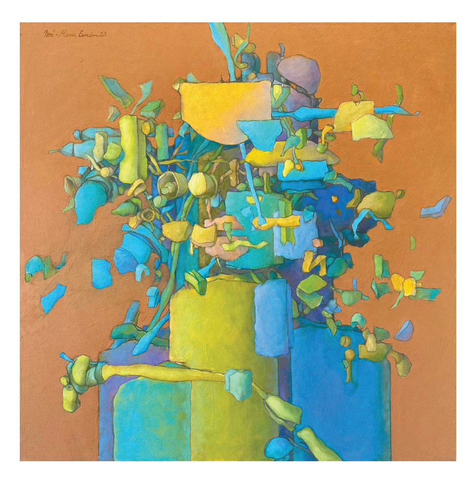
Judah, 2023, oil on canvas, 40" x 40"