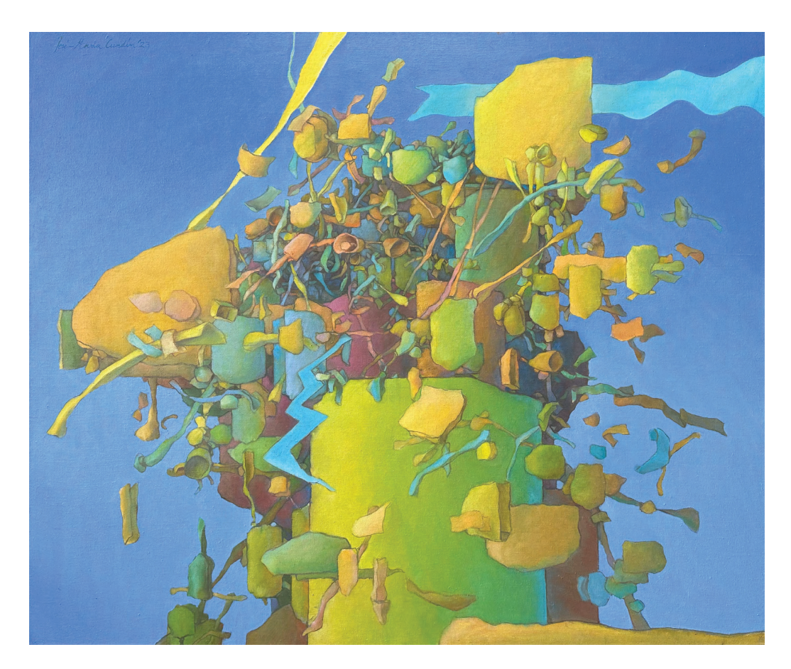
Asher, 2023, oil on canvas, 50" x 60"