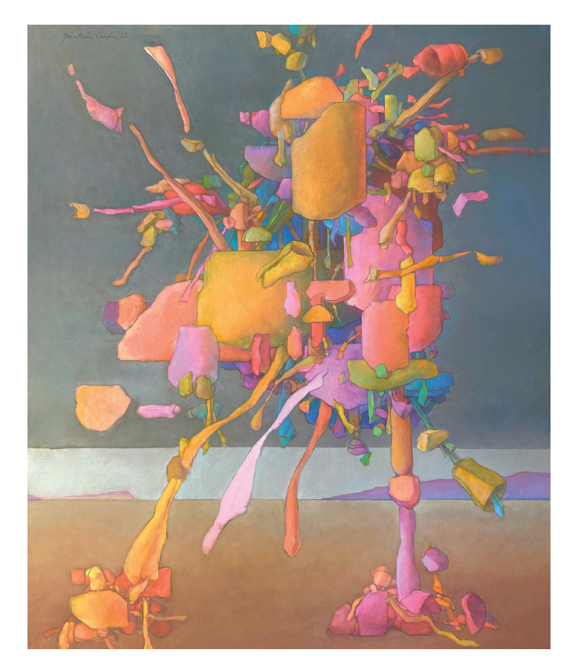
Dan, 2023, oil on canvas, 60" x 50"