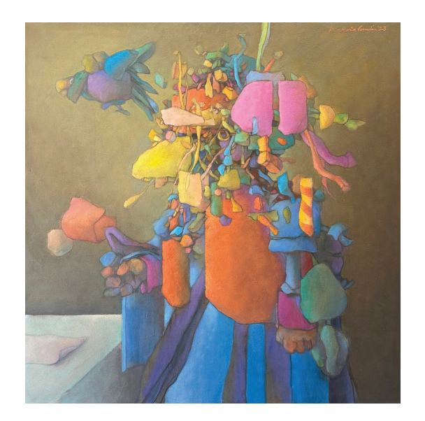
Naphtali, 2023, oil on canvas, 40" x 40"

ARTWORK © JOSE-MARIA CUNDIN 2023 CATALOG © CALLAN CONTEMPORARY 2023