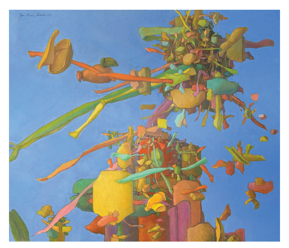
Reuben, 2023, oil on linen, 50" x 60"